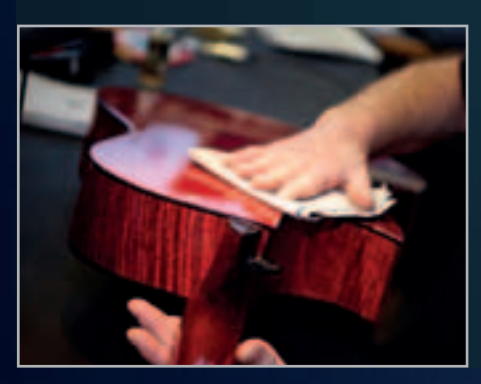
A fresh note of cedar scented polish before we finally pack YOUR instrument.

Ortega MANUFACTURED WITH PASSION. SHIPPED FROM GERMANY.