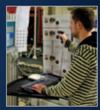
The computer system makes sure YOUR instrument is definitely the one you've choosen some minutes before.