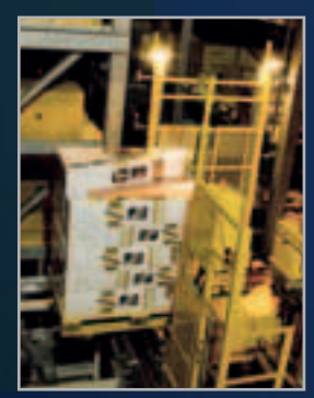
YOUR instrument - carefully picked up by a never sleeping computerized storage/retrieval system.