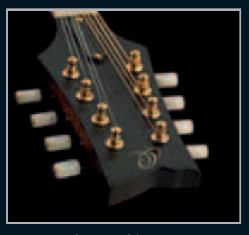
Grover tuning machines.