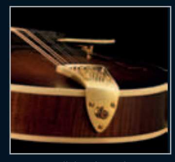
DIECAST tailpiece for perfect tone.