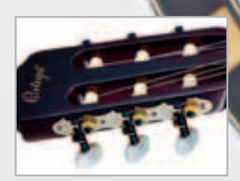
New tuning machines for great tone and tuning stability (selected Natural/Colored Family Series, selected Theatre Series)