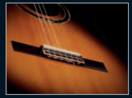
Our NEW 12hole bridge is THE great improvement for top movement and tuning stability.