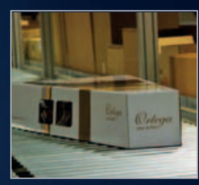
Bye bye – see you at YOUR home or YOUR store.